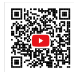
Delta ICT YouTube