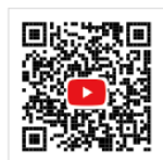
Delta ICT YouTube