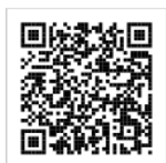
Delta Power Solutions