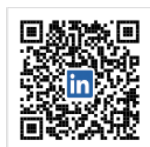
Delta ICT LinkedIn